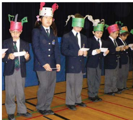
Lower School presenting a story they composed as a class about TRUSTWORTHINESS at the Character Assembly.