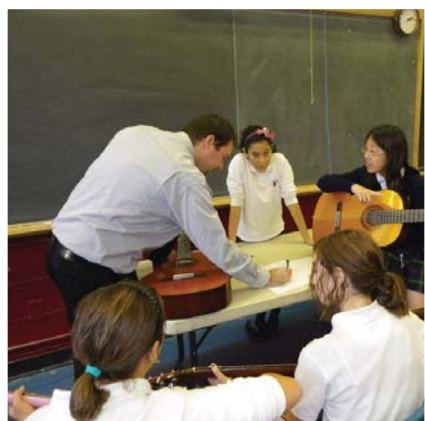
Upper School students practicing for the Upper School Holiday Concert on Wednesday, December 2 nd .