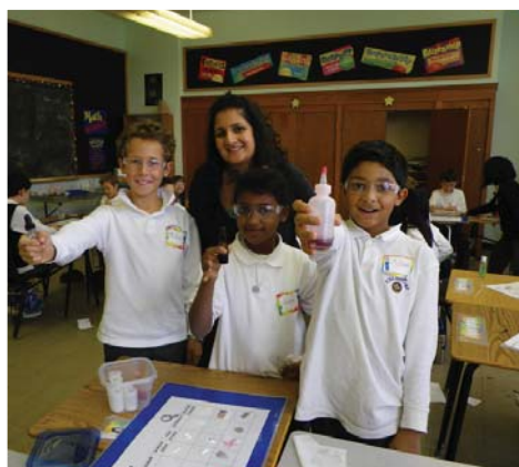
Lower School students identifying mystery substances in the Scientists in the School workshop on chemistry.