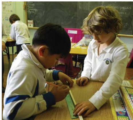
Lower School student constructing a racing car in the Engineering after-school club.